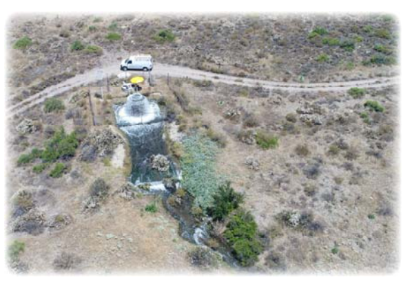
MWD Delivery North of the San Sevaine Basins.

Balance of Recharge and Discharge in MZ-1 . The total amount of supplemental water recharged in MZ-1 since the Peace II Agreement through December 31, 2017 was approximately 84,170 acre-feet, which is about 15,920 acre-feet more than the 68,250 acre-feet required by that date (annual requirement of 6,500 acre-feet). The amount of supplemental water recharged into MZ-1 during the reporting period was approximately 20,539 acre-feet.