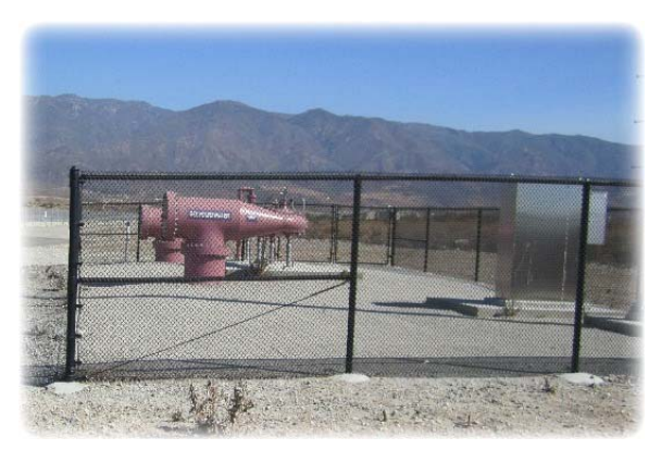
Recycled Water Line at the San Sevaine Basin #5.

concentration of the water supplies available to the IEUA agencies and that future droughts similar to the 2012-2016 period could lead to short term exceedances of the 12-month running-average IEUA agency-wide effluent TDS. For this reason, in October 2016, Watermaster and the IEUA petitioned the Regional Board to consider modifying the TDS compliance metric for recycled water to a longer-term averaging period. The Regional Board agreed that an evaluation of the compliance metric is warranted and directed Watermaster and the IEUA to develop a technical scope of work to support the adoption of a longer-term averaging period. The proposed technical scope of work to support a Basin Plan amendment to revise the recycled water compliance metric was submitted to the Regional Board for approval in May 2017. During this reporting period, Watermaster and the IEUA began implementing the scope of work (following approval to proceed from the Regional Board). The technical work is scheduled to be completed in April 2019. The Basin Plan amendment is scheduled to be completed in December 2019.